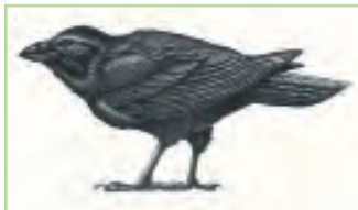
NP-18 Raven upper right