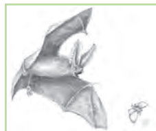
NP-23 Townsend's Big-eared Bat upper right