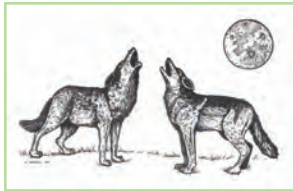
NP-05 Howling Wolves upper right