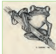
NP-14 Treefrog upper right