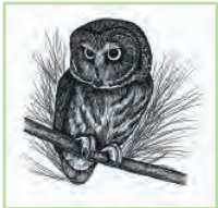
NP-01 Saw-whet Owl upper right