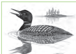
NP-24 Loon upper right