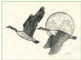
NP-02 Canada Geese upper right