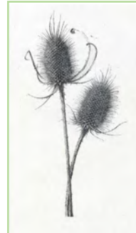
NP-16 Teasel upper left