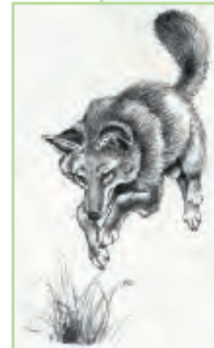
NP-21 Coyote upper right