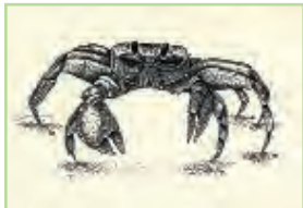
NP-12 Ghost Crab upper left