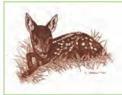
NP-06 Deer upper left