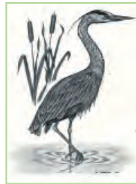
NP-04 Great Blue Heron upper right