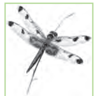
NP-25 Calico Pennant upper left