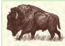
NP-13 Bison upper right