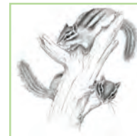
NP-20 Chipmunks upper right