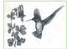
NP-11 Hummingbird upper left