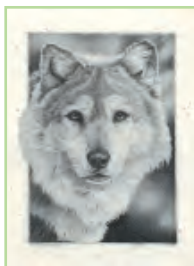
NP-19 Timber Wolf upper right