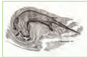
NP-10 Otter upper left